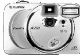
FinePix A200 from FujiFilm.