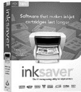
InkSaver Software from Strydent.