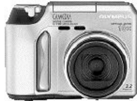
C-730 Ultra Zoom from Olympus.

Here are some choices to consider in various price