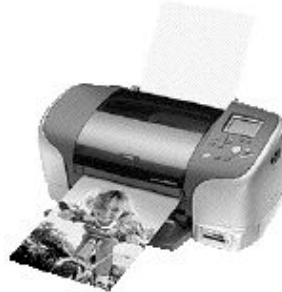
Stylus Photo 925 from Epson.

Any digital camera from FujiFilm is dependable, including the "entry level" FinePix A200. Performance balanced with price, its 2.0 effective megapixel CCD allows for respectable-quality prints. Plus it has a host of easy-to-use features designed to please the newcomer without busting the bank. Eventually, should you be buying a better, more expensive camera, the A200 will remain an effective and reliable back-up.