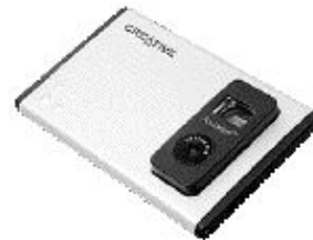
Creative CardCam from Creative Labs.