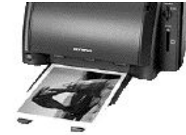
Camedia Digital Color Printer P-400 from Olympus.

and a "Super Macro Mode" that facilitates crystal clear shots of things less than two inches away. The C-730 can be set to automatic, semi-auto or full manual, making it a robust digital picture snapper.